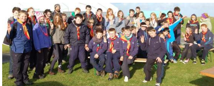
1st Mayo Castlebar Cubs, Scouts and Ventures at the Mayo County Camp in Achill on 23rd-25th September.